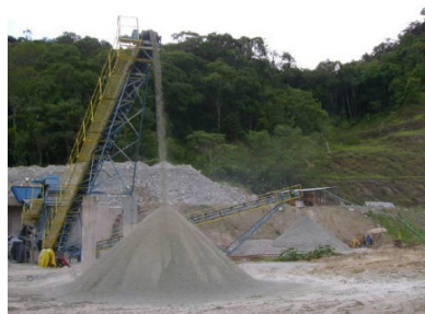
Figure 1 Crusher Operating at Engenho

At Tocantins, Brazil (where Mundo is earning a 51% interest), Mundo reported some outstanding results during the quarter, with best intersections including 2.65m at 37.02g/t and 0.6m at 16.7g/t, with the zone of mineralisation extended to in excess of 2.5km through extended soil sampling.