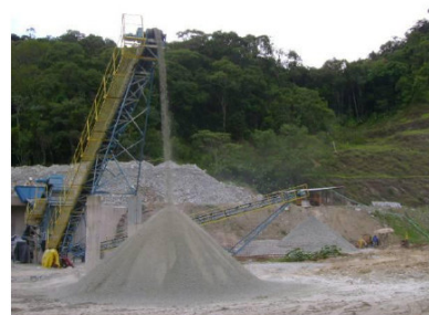
Figure 1 Crusher Operating at Engenho

At Tocantins, Brazil (where Mundo is earning a 51% interest), Mundo reported some outstanding results during the quarter, with best intersections including 2.65m at 37.02g/t and 0.6m at 16.7g/t, with the zone of mineralisation extended to in excess of 2.5km through extended soil sampling.